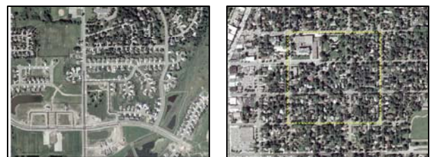
Figure 3.3. Left: A conventional subdivision pattern in Northfield showing a disjointed road network. Right: The traditional neighborhood pattern found in the Neighborhood General Zone.

CI 4.1 Guide new development to be compatible with, and/or expand on the existing grid network (see Figure 3.3).