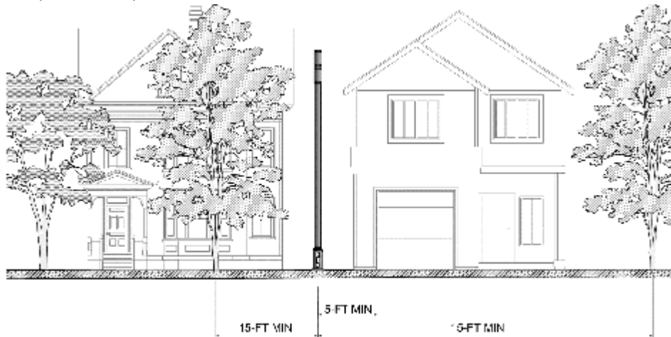
Example of Acceptable Location Between Residential Homes